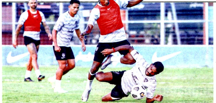
PEMAIN JDT menjalani latihan akhir kelmarin dalam persiapan menghadapi Selangor dalam perlawanan Liga Super di Petaling Jaya malam ini.