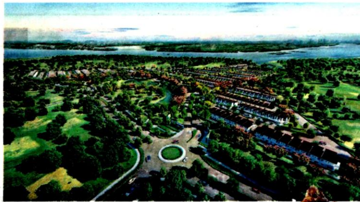
LUKISAN grafik projek hartanah bercampur, Tropicana Danga Cove yang telah mencatat jualan lebih daripada 95 peratus daripada pembeli.

"Sehingga kini, Kumpulan telah bekerjasama dengan 11 entiti dan menyiapkan lebih 45 projek daripada pembangunan bercampur, perbandaran, ke-