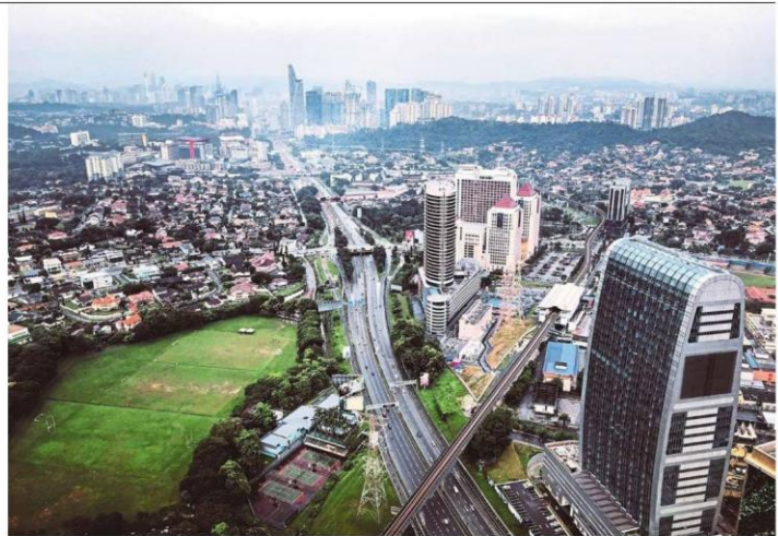
Those living in Petaling Jaya can give their opinion and ideas on MBPJ's annual development budget for 2022.

"The public should also be able to see a recorded version of the meetings.