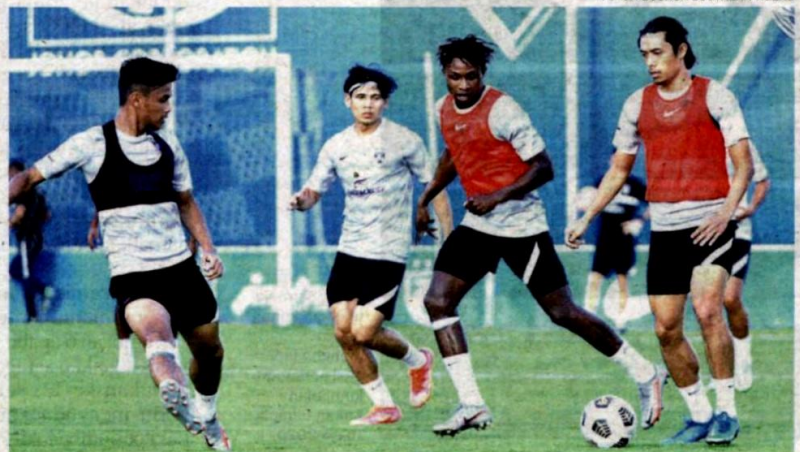
Barisan pemain JDT giat berlatih sebagai persiapan menentang Selangor FC di Stadium MBPJ, Kelana Jaya pada Rabu.

Apa yang paling penting adalah kami perlu berada pada tahap terbaik.