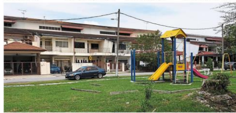
Under the plan, MPC will impose higher assessment tax for residential and commercial properties.